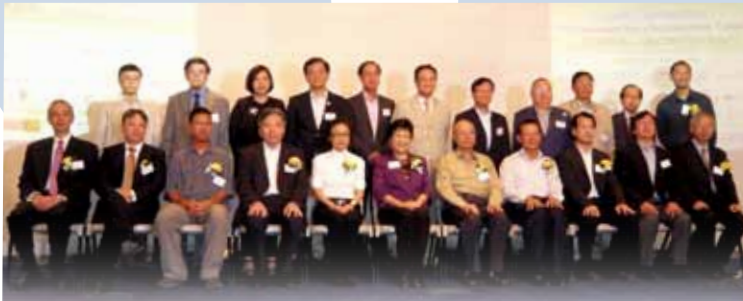
▲ Group photo of guest speakers and representatives of participating organisations